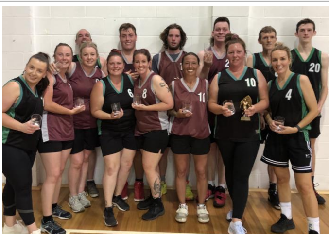
Seniors Maroon (40) def Black (26)

Thank you all for another great season, we look forward to seeing you again next year.