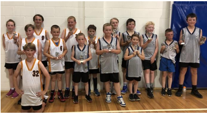
Juniors - Silver (21) def White (20)