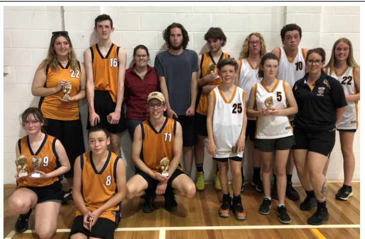
Intermediates Orange (33) def White (26)