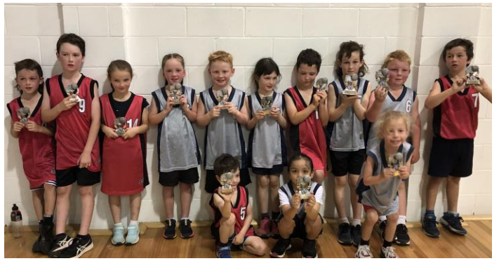
Minis - Silver (17) def Red (16)