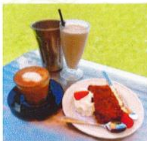
Drinks and Snacks, Coffee and Cake