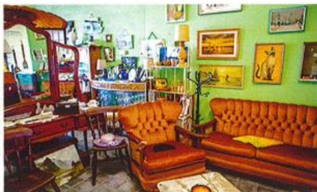
Retro, Collectables and Bric a brac We Buy and Sell